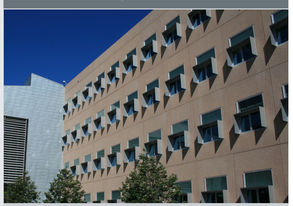
NREL Research Support Facility, photo credit: Bill Gillies, NREL

Prepared for the U.S. Department of Energy by The National Institute of Building Sciences